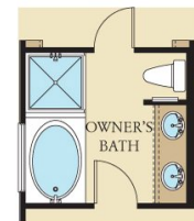
OPTIONAL OWNER'S BATH